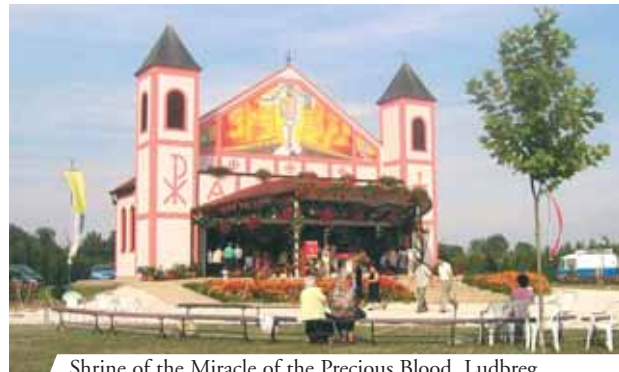
Shrine of the Miracle of the Precious Blood, Ludbreg