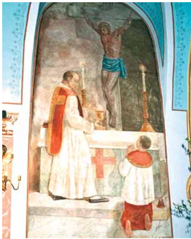
Fresco depicting the scene of the miracle

During Mass at Ludbreg in 1411, a priest doubted whether the Body and Blood of Christ were really present in the Eucharistic species. Immediately after being consecrated, the wine turned into Blood. Today the precious relic of the miraculous Blood still draws thousands of the faithful, and every year at the beginning of September the so-called “Sveta Nedilja - Holy Sunday” is celebrated for an entire week in honor of the Eucharistic miracle that occurred in 1411.