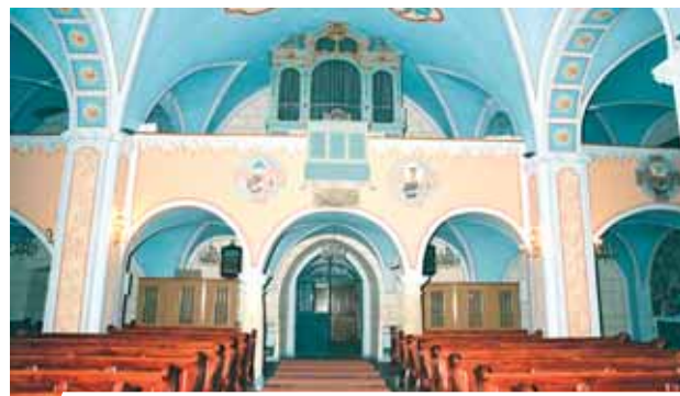
Interior of the shrine