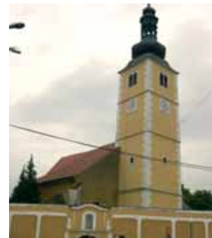
The chapel of the Batthyany family castle where the miracle occurred