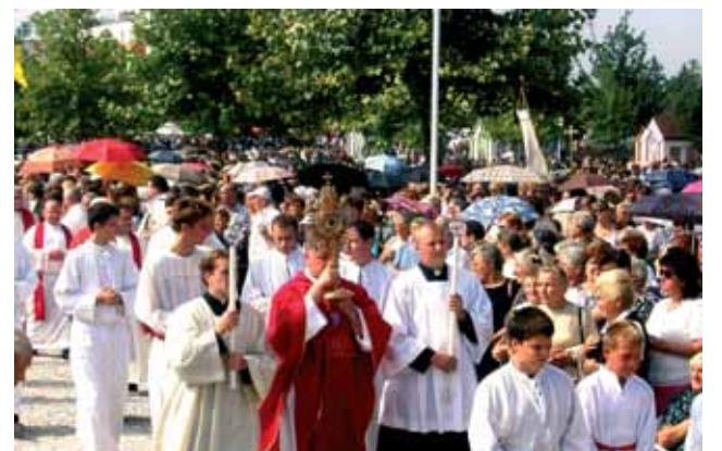
Procession held every year in September, during the week when the miracle called Sveta Nedilja is celebrated