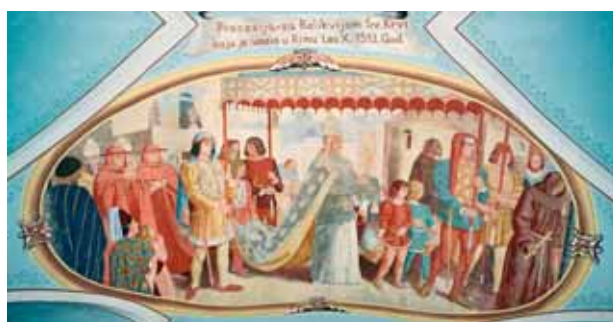
Fresco depicting the procession held in Rome in 1513, in which Pope Leo X is carrying the precious relic through the city streets