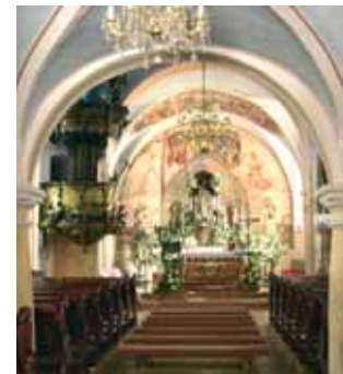
Interior of the chapel of the Batthyany family castle

In 1411 at Ludbreg, in the chapel of the Count Batthyany's castle, a priest was celebrating Mass. During the consecration of the wine, the priest doubted the truth of transubstantiation and so the wine in the chalice turned into Blood. Not knowing what to do, the priest embedded this relic in the wall behind the main altar. The workman who did the job was sworn to silence. The priest also kept it secret and revealed it only at the time of his death. After the priest's revelation, news quickly spread and people started coming on pilgrimage to Ludbreg. The Holy See later had the relic of the miracle brought to Rome, where it remained for several years. The people of Ludbreg and the surrounding area, however, continued to make pilgrimages to the castle chapel. In the early 1500s, during the pontificate of Pope Julius II, a commission was