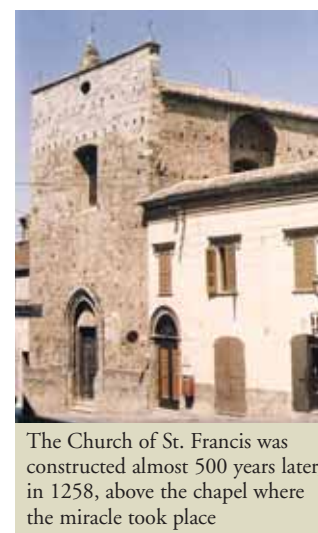
The Church of St. Francis was constructed almost 500 years later, in 1258, above the chapel where the miracle took place