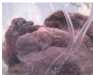
The 5 clots of Blood as seen with a magnifying glass. In the blood of the Miracle can be recognized all the components present in fresh blood, and the miracle within the miracle, each of the 5 clots of Blood weighs 15.85 grams, which is the identical weight of the 5 clots weighed together!