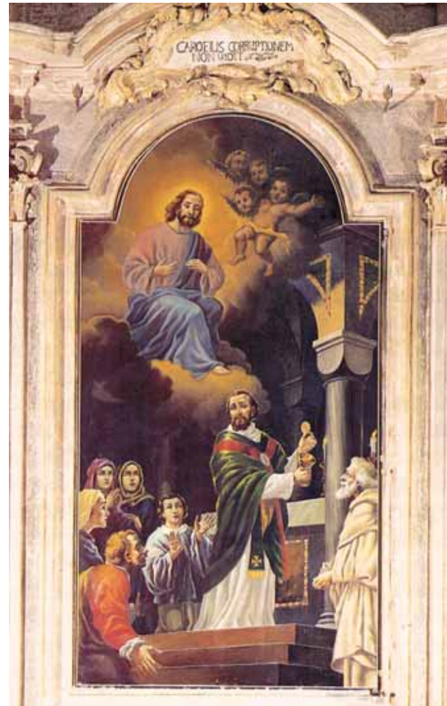
Painting located in the Valsecca chapel which depicts the miracle