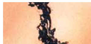
Analysis of the Host. Endocardiac structures