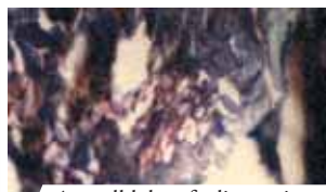
A small lobe of adipose tissue