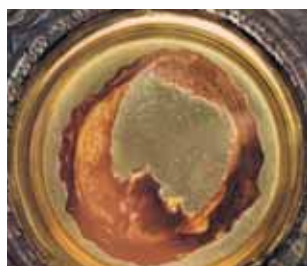
The miracle was the object of several official acknowledgements on the part of the ecclesiastical authorities between 1574 and 1886, not to mention most recently, in 1970, when it was subjected to a scientific examination carried out by professors from the University of Siena, which concluded: "The flesh is true human flesh (formed by muscular tissue from the heart); that the blood is true blood (belonging to the same blood type AB as the flesh); that the component substances are those of human tissues, normal and fresh; that the conservation of the flesh and the blood, left in their natural state for twelve centuries and exposed to the influence of atmospheric and biological elements, remains an extraordinary phenomenon" (The Linoli Report 4131971).