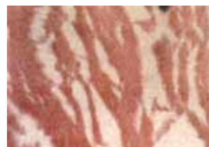
The muscular fiber cells