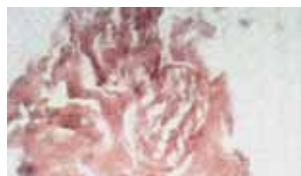
A vagus nerve