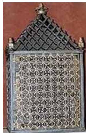
Cubical lattice in gold-plated cast iron in which the relics were preserved for almost 266 years, today returned to the Valsecca family chapel