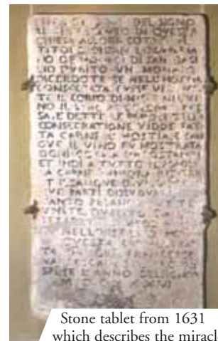
Stone tablet from 1631 which describes the miracle