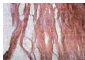
Histological view of the Flesh