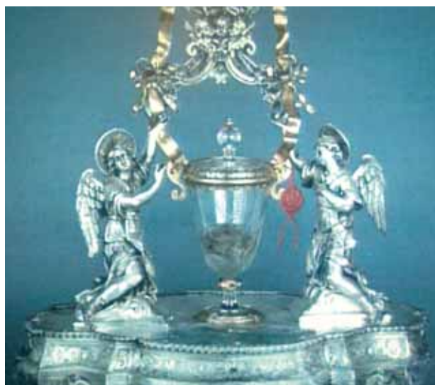
The reliquary from the 18th century containing the Host and the coagulated Blood, gift of the generous citizen Domenico Coli