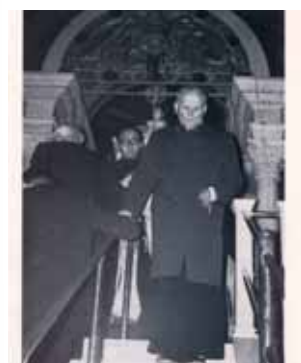
Il Reverendo Pontefice Giovanni Paolo II allora Cardinale di Cracovia davanti alla Ss. Reliquia, con esposizione in sua invocazione: 3.21.1979