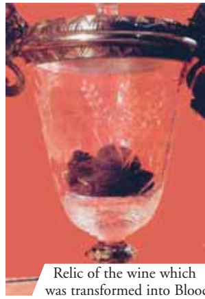
Relic of the wine which was transformed into Blood