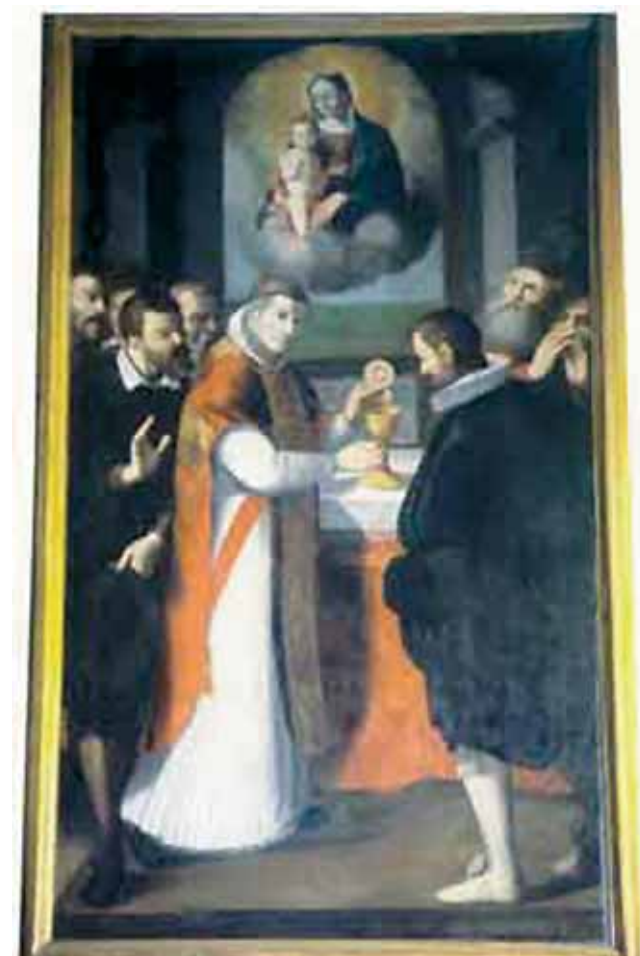
An antique painting depicting the Miracle