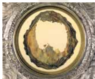
The flesh consists of part of the myocardium, more precisely of the left ventricle. The arteries and veins can be easily identified, as well as a double, slender branch of the vagus nerve. At the time of the miracle, the flesh was living and then submitted to the law of rigor mortis.