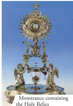
Monstrance containing the Holy Relics

An inscription in marble from the 17th century describes this Eucharistic miracle which occurred at Lanciano in 750 at the Church of St. Francis. “A monastic priest doubted whether the Body of Our Lord was truly present in the consecrated Host. He celebrated Mass and when he said the words of consecration, he saw the Host turn into Flesh and the Wine turn into Blood. Everything was visible to those in attendance. The Flesh is still intact and the Blood is divided into five unequal parts which together have the exact same weight as each one does separately.